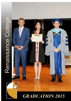
(Graduation Stage Shot)