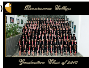
(Graduation Group photo) (Formal / Funny)